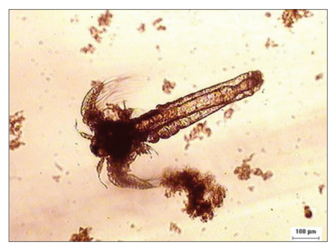
Figure 1: Stereo microscope image of Artemia salina nauplus after 24 hrs treatment with 100 mg/ml Euphorbia hirta flower extract

the mice with the extract. During the 8h observation period, the extract treated animals were inactive, refused food and water and had increase in the breathing and heart beat. Thereafter, most animals became active and behaved normally. Generally, the male mice showed a more sensitive response to oral administration of E. hirta leaf extract. No significant changes in general appearance or behavioral pattern were noted till the end of 14 days. Normal weight gain was detected in the treated and the control groups. No statistically significant differences existed in the absolute (g) and relative weights (%) of almost all the isolated organs between the treated and the control mice (P > 0.05), Table 4. Only the female spleen relative weight index had probability value of less than 0.05. However, macroscopic