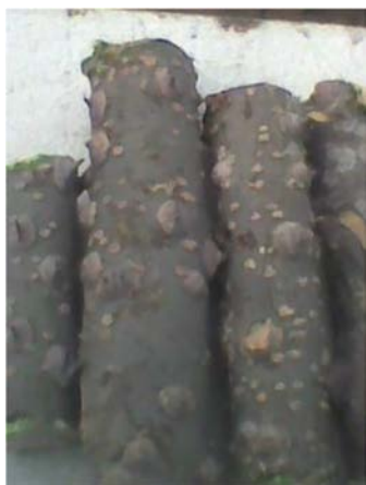
Figure 1: Stem-bark of Zanthoxylum alatum Roxb.